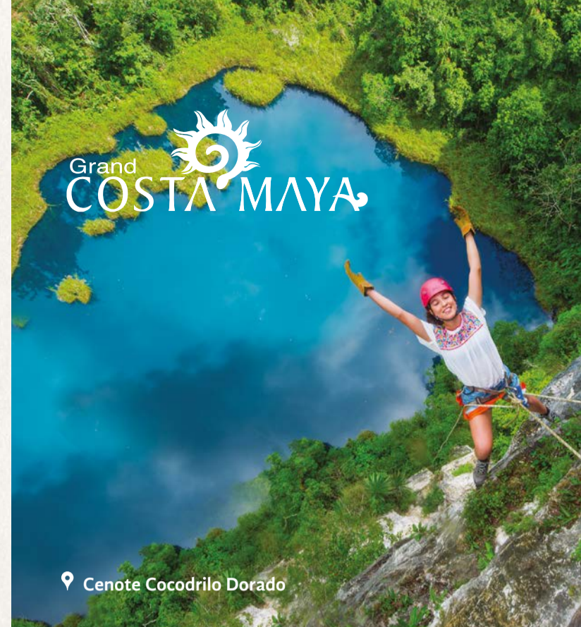
Cenote Cocodrilo Dorado

Quintana Roo Tourism Board Paseo Cobá Mall Mza. 29 Lote 3, 1st floor Fracc. Playacar Fase II Playa del Carmen, Quintana Roo, Mexico.